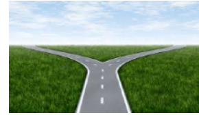
Jesus' Path or New Age Path

Many New Agers believe Jesus was enlightened, like the Buddha and other spiritual leaders. (Enlightenment - to have a consciousness of being divine.) If Jesus was enlightened, then we can trust what He believed and said. Jesus trusted the Jewish scriptures, the Old Testament books of the Bible, and quoted them many times throughout His life. He said “the scriptures cannot be broken” (John 10:35). Jesus’ path followed the Old Testament. The New Testament was written by His disciples who followed Jesus’ path. Let’s look at Jesus’ pathway and where it leads. His way is logical and reasonable. “Come now, and let us reason together,” Says the Lord” (Isaiah 1:18).